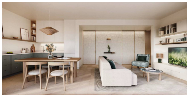
LIVING & DINING RENDERING