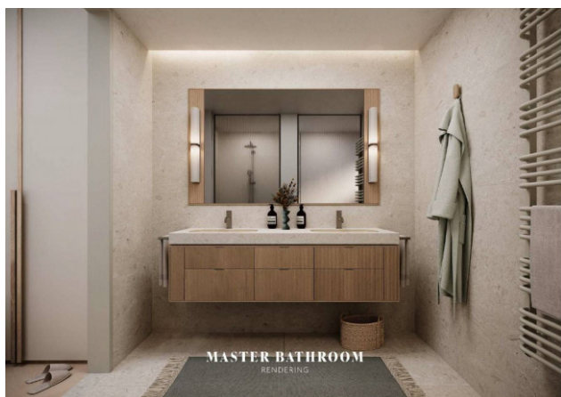
MASTER BATHROOM RENDERING