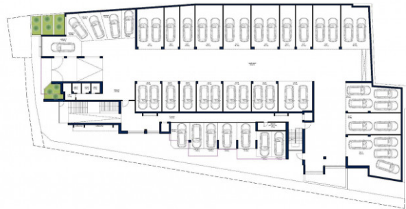
PIANO SVILUPPATO SCALA 1:200