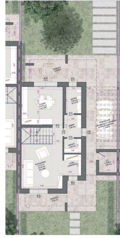
PIANTA PRIMO PIANO