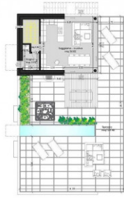
Pianta piano copertura - scala 1:100