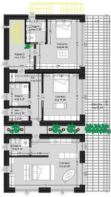
Pianta piano primo - scala 1:100