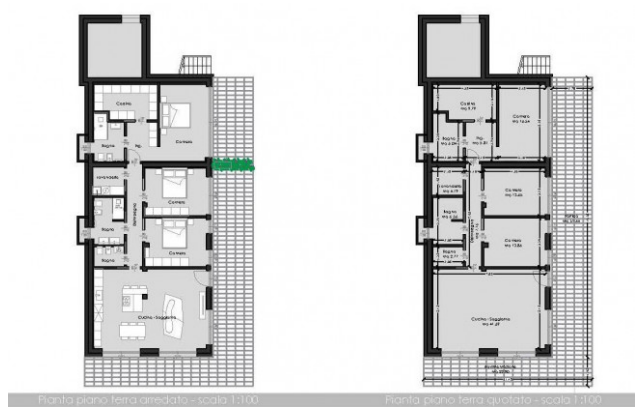
Pianta piano terra arredato - scala 1:100 Pianta piano terra quotato - scala 1:100