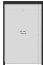
Pianta piano terra - scala 1:100