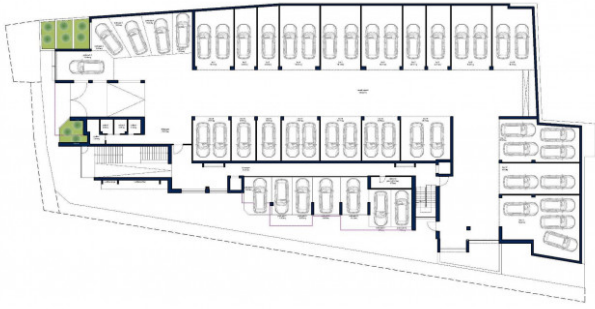
PIANO SEMINTERRATO SCALA 1:200