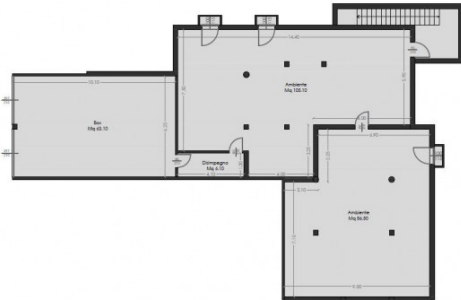
Piano interrato - scala 1:100