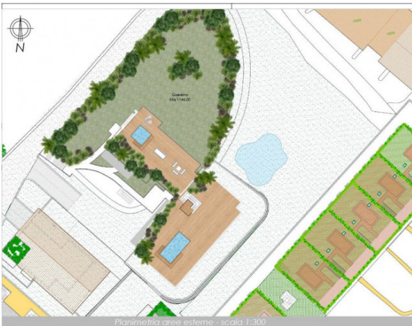
Planimetria aree esterne - scala 1:300