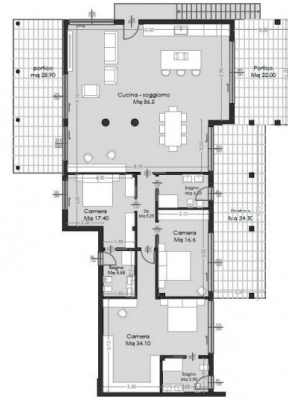
Piano terra arredato - scala 1:100