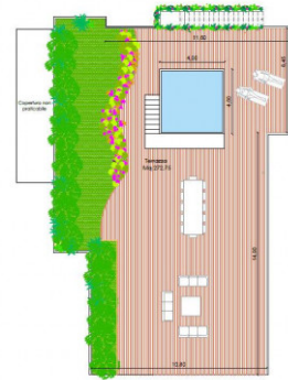
Piano terrazza - scala 1:100